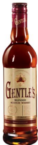
WHISKEY "GENTLE'S" 0,5 L 40 %