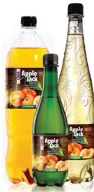
"APPLE JACK. WHITE SWEET CHERRY"