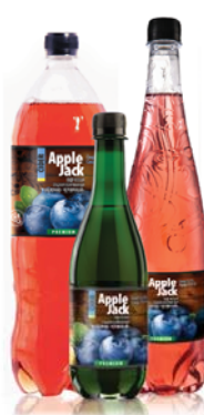
"APPLE JACK. APPLE AND BLUEBERRY"