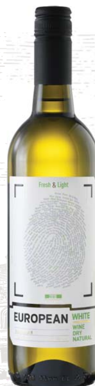
European white natural dry white grape wine alc. 9 - 13,5 % 0,7l