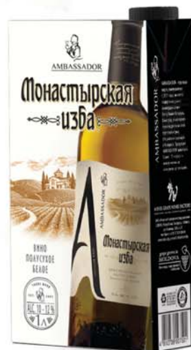
MONASTIC LOG HUT natural semi-dry white grape wine alc. 9 - 13 % sugar 20 g/l 1 L