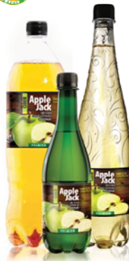
"APPLE JACK. APPLE"