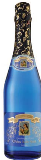
MEINE LIEBE FRAU natural semi-sweet white effervescent grape wine alc. 10-12 % sugar 45 g/l 0,75 l