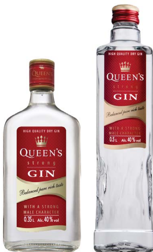
GIN "QUEEN'S" 0,35 L 40 %