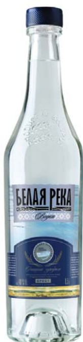
VODKA "WHITE RIVER"