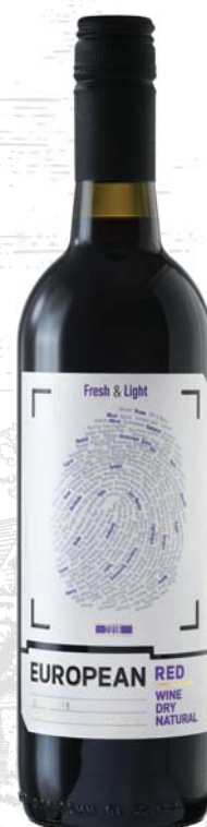
European red natural dry red grape wine alc. 9 - 13,5 % 0,7l

THE EXCESSIVE CONSUMPTION OF ALCOHOL IS HARMFUL TO YOUR HEALTH