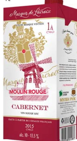
CABERNET natural dry red vintage grape wine alc. 10-13 % sugar 45 g/l 1 L