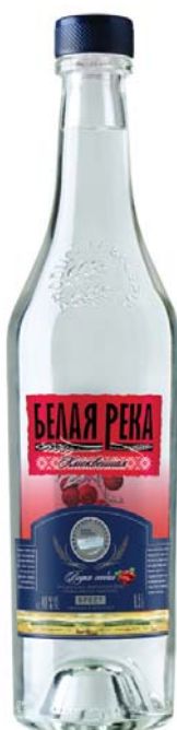
SPECIAL VODKA "WHITE RIVER. CRANBERRY"