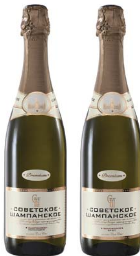
SOVIET CHAMPAGNE VINTAGE semi-sweet alc. 10,5-12,5 % sugar 60-65 g/l 0,75 l