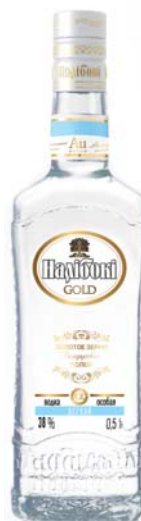
VODKA "NALIBOKI GOLD. LIGHT" 0,5 L 38 %