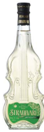
STRADIVARI. MUSCATEL natural semi-sweet white grape wine alc. 9-13 % sugar 60 g/l 0,7 l