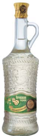
CHARDONNAY natural semi-sweet white grape wine alc. 10-13 % sugar 40 g/l 0,7 l