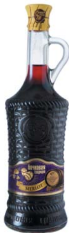
MERLOT natural semi-sweet red grape wine alc. 10-13 % sugar 40 g/l 0,7 l