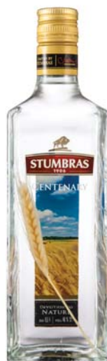
FLAVOURED VODKA "STUMBRAS. CENTENARY"