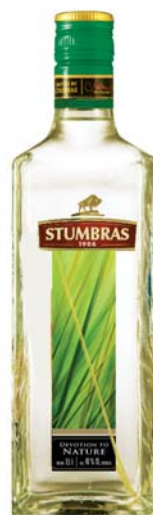
FLAVOURED VODKA "STUMBRAS. BISON GRASS"