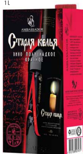
OLD MONASTIC CELL natural semi-sweet red grape wine alc. 9 - 13 % sugar 65 g/l 1 L