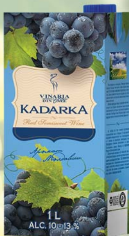
KADARKA natural semi-sweet red grape wine alc. 10-13 % sugar 40 g/l 1 L