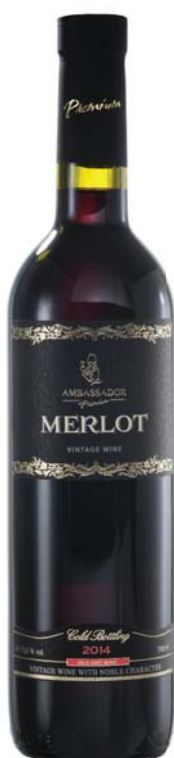
Merlot natural dry red vintage grape wine alc. 10-13,5 % 0,75l