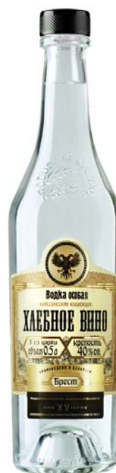
SPECIAL VODKA "CLASSIC COLLECTION. BREAD WINE"