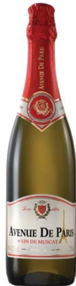
AVENUE DE PARIS natural "Muscatel" effervescent grape wine alc. 10-12 % sugar 40 g/l 0,75 l