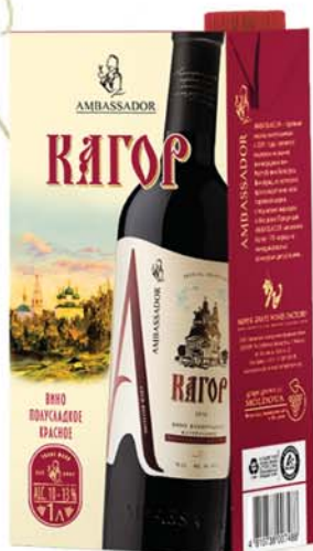
CAHORS natural semi-sweet red grape wine alc. 10-13 % sugar 65 g/l 1 L