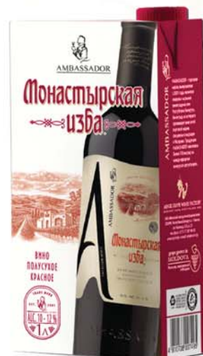
MONASTIC LOG HUT natural semi-dry red grape wine alc. 9 - 13 % sugar 20 g/l 1 L