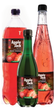
"APPLE JACK. APPLE AND STRAWBERRY"