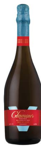
MERLOT GLAMOUR natural semi-sweet red effervescent grape wine alc. 9-13 % sugar 50 g/l 0,75 l

THE EXCESSIVE CONSUMPTION OF ALCOHOL IS HARMFUL TO YOUR HEALTH