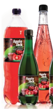
"APPLE JACK. APPLE AND CHERRY"