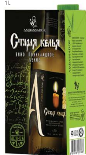
OLD MONASTIC CELL natural semi-sweet white grape wine alc. 9 - 13 % sugar 65 g/l 1 L