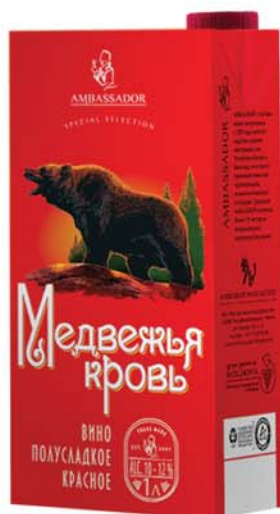
BEAR'S BLOOD natural semi-sweet red grape wine alc. 9 - 13 % sugar 40 g/l 1 L