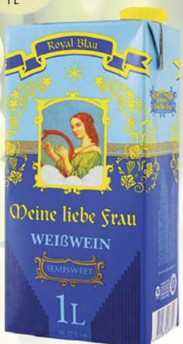
MY FAIR LADY natural semi-sweet white grape wine alc. 9-13 % sugar 45 g/l 1 L