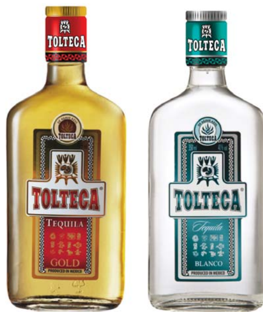
TEQUILA "TOLTECA GOLD" 0,35 L 40 %

The distinctive feature of "Queen's" is the thorough filtering of all its components. High production standards allow making a very high-quality gin, really worthy of the Queen's taste.