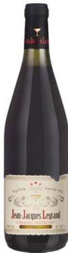
CABERNET-SAUVIGNON natural dry red vintage grape wine alc. 11-13,5 % 0,75 l