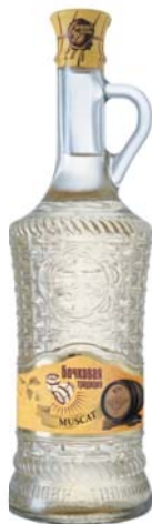
MUSCAT natural semi-sweet white grape wine alc. 10-13 % sugar 40 g/l 0,7 l