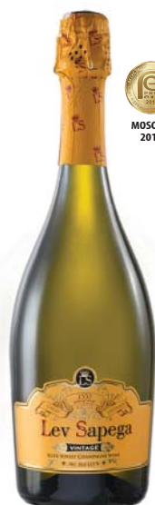
LEV SAPEGA semi-sweet aged soviet champagne alc. 10,5-12,5 % 0,75 l