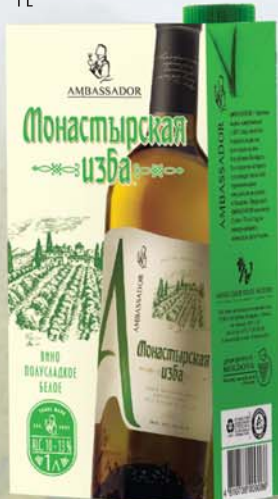
MONASTIC LOG HUT natural semi-sweet white grape wine alc. 10-13 % sugar 40 g/l 1 L