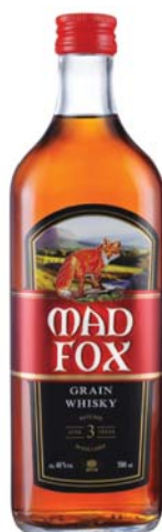
WHISKEY "MAD FOX" 0,5 L 40 %

"Raeburn" is a high-quality blended whiskey, aged in oak barrels for three years. It is blended from single malt Scotch mixed with three-year grain whiskey. It is bottled under a license agreement and under control of Glasgow Whisky Limited.