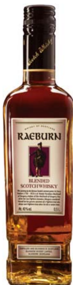
WHISKEY "RAEBURN" 0,5 L 40 % 0,2 L

Gentle's is a 40 % Scotch whiskey with a bold, hard-edged and balanced taste. It is rich and spicy, and has an amazing depth. It is served in pure form, with ice or as an ingredient for a cocktail.