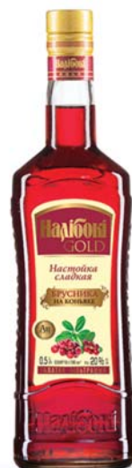
FLAVORED VODKA "NALIBOKI GOLD. COWBERRY ON COGNAC" 0,5 L 20 %

VOLUME 0,2 0,35 0,5 L, ALCOHOL 20 % 38 % 40 %