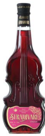
STRADIVARI. SYRAH natural semi-sweet red grape wine alc. 9-13 % sugar 60 g/l 0,7 l