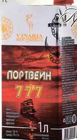
PORT WINE 777 special strong red grape wine alc. 18 % sugar 70 g/l 1 L