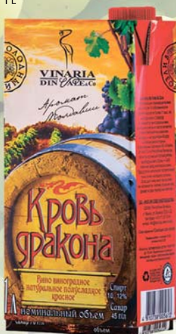
DRAGON'S BLOOD natural semi-sweet red grape wine alc. 9 - 13 % sugar 45 g/l 1 L