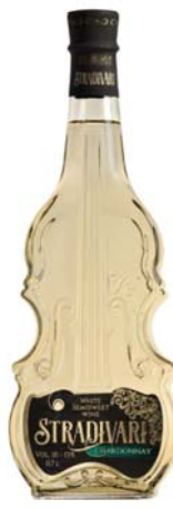
STRADIVARI. CHARDONNAY natural semi-sweet white grape wine alc. 10-13 % sugar 40 g/l 0,7 l