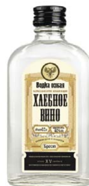
SPECIAL VODKA "CLASSIC COLLECTION. BREAD WINE"