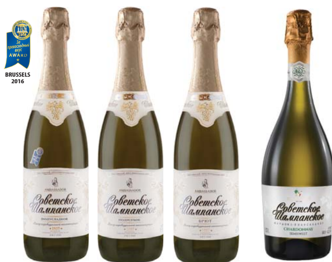
SOVIET CHAMPAGNE semi-sweet alc. 10,5-12,5 % sugar 75 g/l 0,75 l