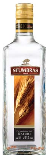
FLAVOURED VODKA "STUMBRAS. ON BREAD"