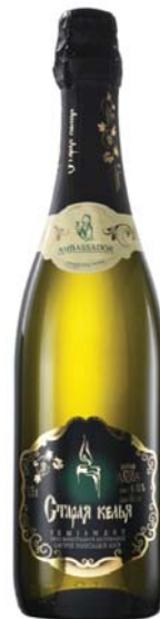
OLD MONASTIC CELL natural semi-sweet white effervescent grape wine alc. 10-13 % sugar 65 g/l 0,75 l