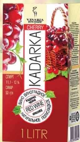
KADARKA CHERRY natural semi-sweet red grape wine alc. 12,1-13 % sugar 50 g/l 1 L