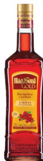
FLAVOURED VODKA "NALIBOKI GOLD. CRANBERRY ON COGNAC" 0,5 L 20 %