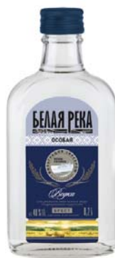
SPECIAL VODKA "WHITE RIVER"