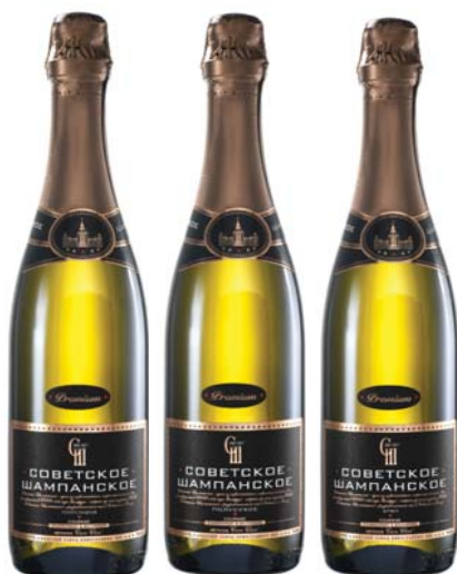
SOVIET CHAMPAGNE semi-sweet alc. 10,5-12,5 % sugar 75 g/l 0,75 l