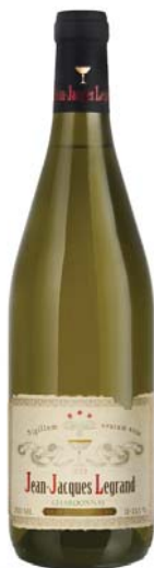
CHARDONNAY natural dry white vintage grape wine alc. 11-13,5 % 0,75 l