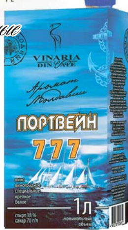
PORT WINE 777 special strong white grape wine alc. 18 % sugar 70 g/l 1 L