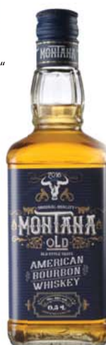
BOURBON "MONTANA OLD" 0,5 L 40 %

"Mad Fox" is a product of the mid-price segment. This grain whiskey has a mild, rounded and well-balanced aroma, adequately complemented by a rich flavour-smooth, with a touch of pleasant oiliness and long aftertaste.