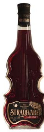
STRADIVARI. CABERNET natural semi-sweet red grape wine alc. 10-13 % sugar 40 g/l 0,7 l

THE EXCESSIVE CONSUMPTION OF ALCOHOL IS HARMFUL TO YOUR HEALTH