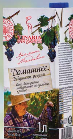
HOMEMADE. GRANDFATHER'S RECIPE natural semi-sweet red grape wine alc. 9 - 13 % sugar 40 g/l 1 L