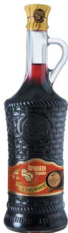
CABERNET natural semi-sweet red grape wine alc. 10-13 % sugar 40 g/l 0,7 l