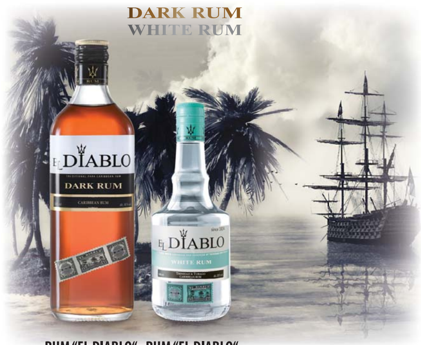
RUM "EL DIABLO" DARK 0,5 L 40 % RUM "EL DIABLO" WHITE 0,5 L 38 %