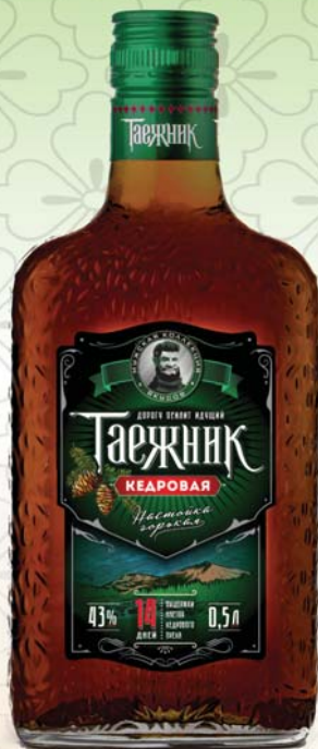
FLAVOURED VODKA "TAIGAN" 0,5 L 43 %