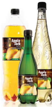
"APPLE JACK. APPLE AND PEAR"