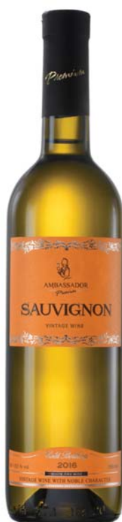
Sauvignon natural dry white vintage grape wine alcohol 10-13,5 % 0,75l