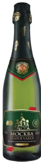
MOSCOW ZLATOGLAVAYA natural semi-sweet white effervescent grape wine alc. 10-13 % sugar 40 g/l 0,75 l