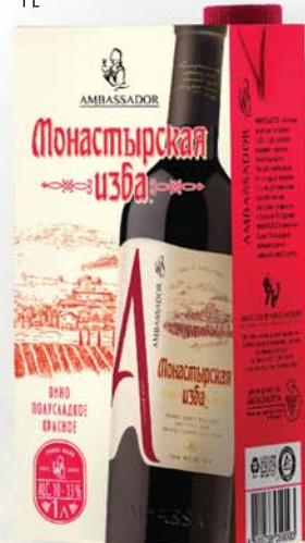
MONASTIC LOG HUT natural semi-sweet red grape wine alc. 10-13 % sugar 40 g/l 1 L