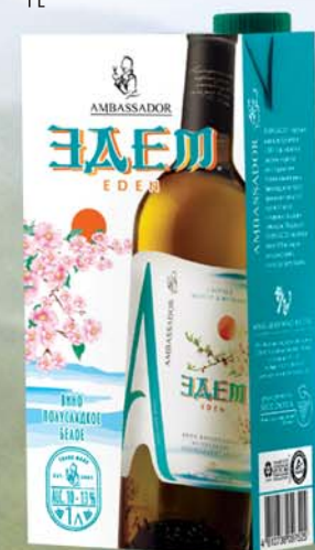
EDEN natural semi-sweet white grape wine alc. 10-13 % sugar 70 g/l 1 L

THE EXCESSIVE CONSUMPTION OF ALCOHOL IS HARMFUL TO YOUR HEALTH