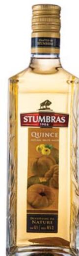
LIQUOR "STUMBRAS. QUINCE"